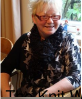
The Knit Wits Christmas Party!