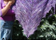
Almost finished recently finished shawl